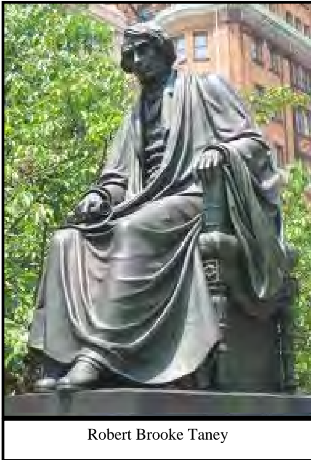
Robert Brooke Taney