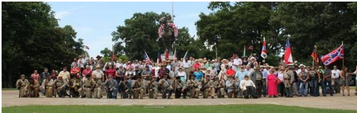
2013 Forrest Birthday Celebration at Forrest Park

American by Birth Southern and Saved By the Grace of God