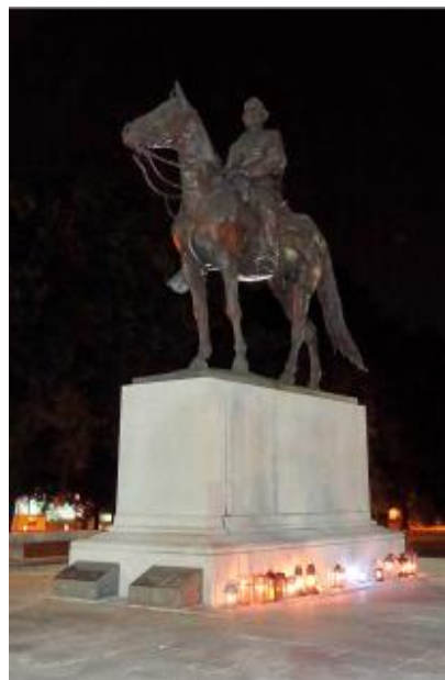
N.B. Forrest Candlelight Vigil –Forrest Park Memphis, Tennessee October 29, 2013