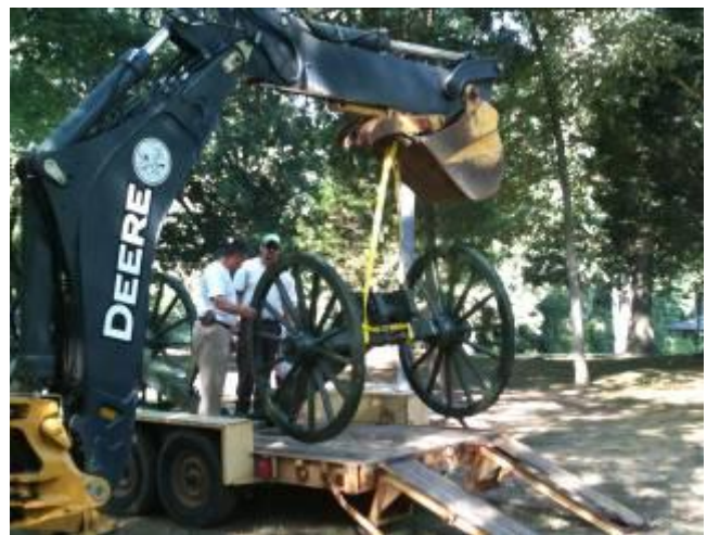
New Cannon Carriages Arrive at Fort Germantown

American by Birth Southern and Saved by the Grace of God