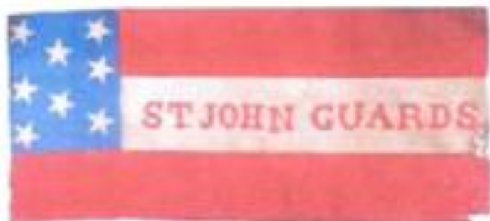
18th Tennessee Infantry Regiment