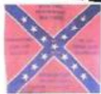
14th Tennessee Infantry

The Tennessee Division of the Sons of Confederate Veterans generously donates a portion of the tag sales to the Tennessee State Museum to be solely used for the museum's flag conservation program. If you do not have a SCV tag, you need to get one to help preserve your history.