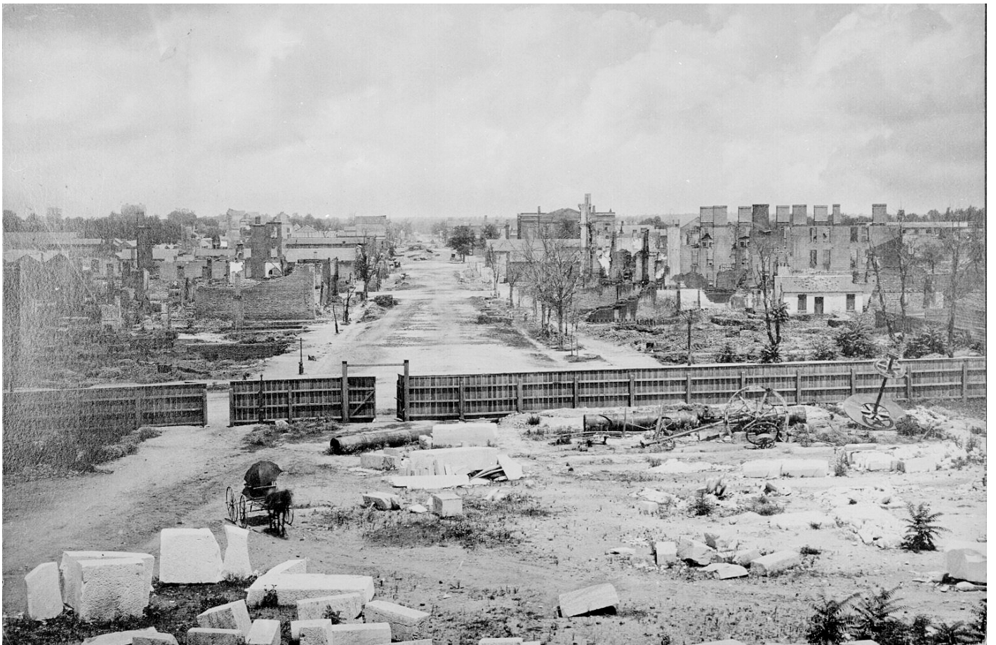
Ruins as seen from the State Capitol in Columbia, South Carolina

Official Organ Of The Samuel R. Watkins Camp #29 Sons of Confederate Veterans